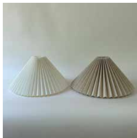
Danish Pleated Shades $68 white or linen

Small 10" bottom diameter Medium 13" bottom diameter Tall 12" bottom diameter